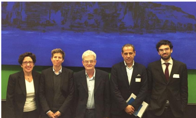
allegations made against Palestinian and Israeli HROs.

2017, Adalah and HRO partners participated in a further mission to Denmark led by EuroMed Rights, that focused on shrinking space and the threat posed to HROs by right-wing groups in Israel and Europe. A few months earlier, the Danish Government had opened an investigation into its funding of HROs in Israel and Palestine. Update: A hearing was held in Denmark at the end of January 2018. The Danish Government announced at that hearing that it had found no hard evidence to support the