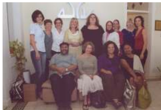
Nobel Women’s Initiative delegation at Adalah

Adalah provided information to Amnesty International (AI) for their upcoming report on the land and housing rights of the Arab minority in Israel, and hosted a meeting with the director of AI-UK and leading lawyers and housing rights activists at our offices in 11/10.