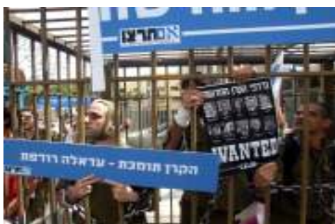
Radical right-wing group Im Tirtzu protests against the NIF and Adalah

European Parliament, Committee on Foreign Affairs, Sub-Committee on Human Rights. In 6/10, Adalah submitted a briefing paper to this committee entitled "Restrictions on human rights organizations and the legitimate activities of Arab political leaders in Israel," in advance of its hearing on "The Situation of NGOs and civil society in Israel." This paper was sent, together with presentations by PCATI and the EMHRN, to dozens of MEPs and was used extensively as a reference by them.