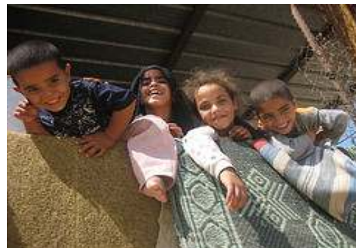
Arab Bedouin children.

In 4/10, the National Insurance Institute (NII) announced that a tender for leasing a new NII building in the Arab town of Shafa’amr had been completed and that the new building was being renovated for use at the end of 2011. The announcement came in response to numerous public demonstrations and an urgent letter sent by Adalah to the NII and Minister for Social Welfare complaining about the conditions of the existing NII building. Adalah argued that persons with disabilities could not access the current building to obtain the services they are entitled to by law.