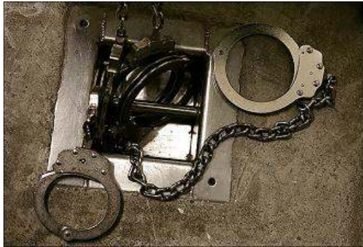
Shackling cuffs for interrogation

prisoners concerning their conditions of confinement to the district courts. However, in 10/10, following the appeal, the State Attorney's Office instructed the IPS not to block any petitions submitted by prisoners and to transfer them to court immediately.