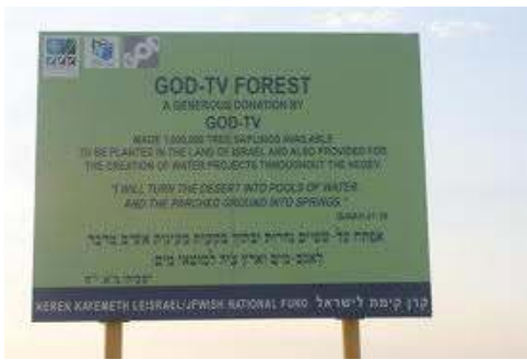
JNF forestation in the Naqab.

In 12/10, Adalah sent a letter to the ILA demanding the cancellation of an internal ILA decision ordering public land to be transferred to the Jewish National Fund (JNF) for forestation . The stated purpose of the decision is to “maintain control” of the land, and it was issued despite the fact that the land in question is not earmarked for the purpose in the national master plan for forestation. By transferring public land to the JNF, a body that admits it serves the interests of Jewish citizens only, the decision will prevent Arab use of the land, especially in the Naqab.