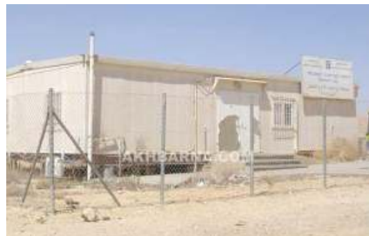
Mother and child clinic in the Naqab

The Health Ministry re-opened mother and child clinics in two Arab Bedouin villages in the Naqab : The ministry made the announcement in 8/10, stating that a clinic in Abu-Tlul village would be open three days a week, and a second clinic in Qasr al-Sir for two days a week. The