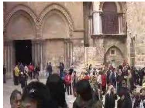
Jaffa Gate, Old City of Jerusalem