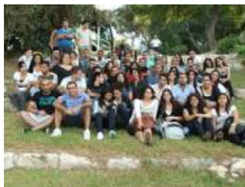
Participants in Adalah's 5th Annual Arab Law Students' Conference

In 10/10, Adalah held its 5th Annual Arab Law Students' Conference at Wahat al-Salaam/Neve Shalom. The 3-day event, entitled “The Right to Protest,” was attended by 60 Arab law students, who took part in a series of workshops and legal lectures led by prominent legal academics, lawyers and human rights