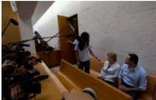
Mairead Maguire at a court hearing

In a sensational ruling, the Supreme Court deported Irish Nobel Prize Winner Mairead Maguire in 10/10, following deportation proceedings in the Magistrate, District and Supreme Court during 9/10 and 10/10 in which Adalah represented Ms. Maguire. The Court argued that procedures required her to challenge the 10-year entry ban (received after her participation in the Gaza Freedom Flotilla) from Ireland.