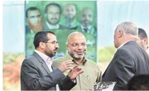
PLC members threatened with deportation. They are taking refuge at the Red Cross in Jerusalem.

attend an academic conference in Tunis three years ago.