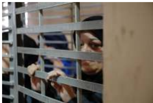
Palestinian women prisoners

ill-treatment of Palestinians in the OPT (with PHR-I and Al Mezan). An Adalah attorney attended the Committee's review of Israel at the UN in Geneva in 7/10. Adalah will use these COs (totaling 22) as persuasive authority in its litigation before the Israeli courts, and in future local and international advocacy.