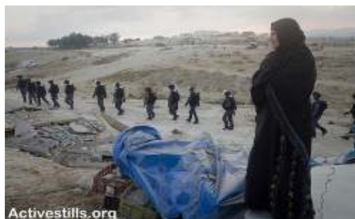
A Bedouin woman watching Israeli police entering Al-Araqib.

In 8/10, Adalah demanded criminal investigations into the police involved in the demolition of the unrecognized Arab Bedouin village of Al-Araqib in the Naqab , and into the presence of Tax Authority officials and the illegal debt collection operation. Police razed all 45 houses in the village to the ground and left all 250 villagers without a roof over their heads, with all their belongings confiscated. Adalah also published a position paper on behalf of 10 human rights and social