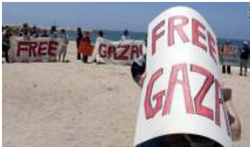
Demonstrations against the Israeli attacks on the Mavi Marmara

On 31 May 2010, in international waters, the Israeli navy intercepted and attacked the Mavi Marmara , one of six ships taking part in the Gaza Freedom Flotilla .