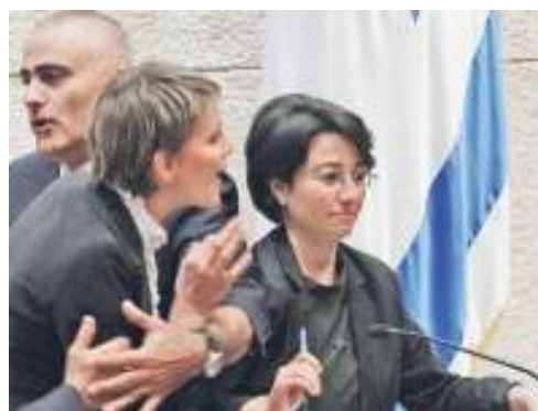
MK Zoabi being attacked in the Knesset

separate offenses in a criminal indictment filed against him , as a violation of criminal law and breach of his parliamentary immunity. MK Barakeh is accused of assaulting or insulting police officers during anti-Wall and anti-war demonstrations between 2005 and 2007. In 3/10, the Inter-Parliamentary Union (IPU) affirmed that leading and participating in demonstrations is an integral part of the parliamentary mandate.