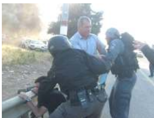
MK Barakeh during a demonstration

The political persecution of Arab MKs: In 2010, Adalah represented three Arab Members of Knesset (MKs) who have been charged with various criminal offenses and whose parliamentary immunity and privileges have been revoked or threatened.