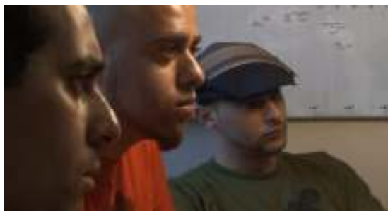
Palestinian rap group DAM during the making of Targeted Citizen

Targeted Citizen is a short film produced by Adalah on discrimination against Arab citizens in Israel, with a soundtrack by Palestinian rap group DAM. It was directed and written by Rachel Leah Jones. The film went “viral” in the second half of 2010, being viewed by tens of thousands of people on websites and Facebook , and it will be shown at several film festivals abroad. The film has proved an effective means of exposing Israel’s treatment of the Arab minority to wide audiences.