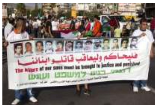
Demonstrators calling for justice and accountability for the October 2000 victims

October 2010 marked 10 years since the brutal killings of 13 unarmed Palestinian citizens of Israel and the injury of hundreds of others by the Israeli police and security forces during protest demonstrations throughout Israel. After a decade of legal, social and political struggle there has still been no implementation of the Or Commission of Inquiry's recommendations and none of the police officers, commanders or political leaders responsible for the killings and injuries have been held accountable.