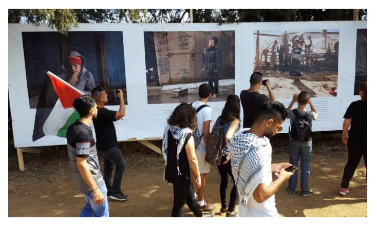
The police granted a permit for the "March of Return" to the Association for the Defense of the Rights of the Internally Displaced in Israel, which holds this annual protest to commemorate the Nakba. The police initially refused to grant a permit claiming that the march would pose a threat to public safety. After a permit was granted following letters sent by Adalah, in May 2017 thousands of people were able to take part in the march, which Adalah documented. See live postings

The IPS installed radiators in Palestinian prisoners' cells in February 2017 in Gilboa prison, in response to Adalah's demand for heating. Adalah argued in a letter sent in August 2016 that the lack of heating during winter months amounted to inhumane treatment and had a negative impact on the prisoners' daily functioning, health and physical wellbeing. The population of security prisoners at the prison is approx. 800 Palestinian prisoners. <u>Press release</u>