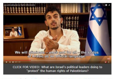
As we mark the <u>70th annual International Human Rights Day</u> on 10 December, Israel's parliament continues to violate the rights of Palestinians in Israel and in the OPT.

Who said the Israeli Knesset doesn't care about human rights? Watch this video to learn how Israeli parliamentarians "protect" the human rights of Palestinians in Israel and the Occupied Palestinian Territory.