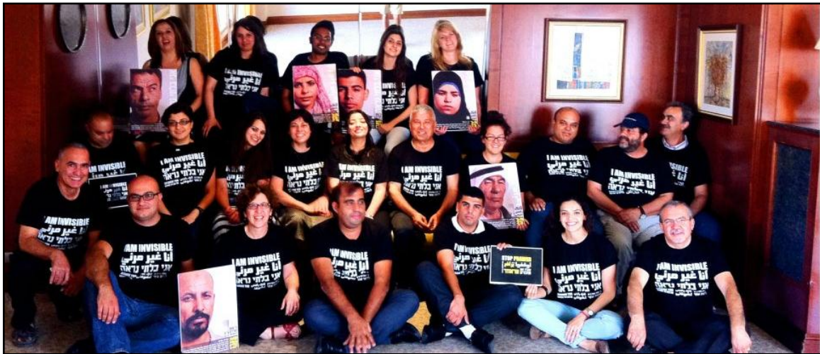
Adalah's Board and staff say, "Stop Praver"! Jericho, July 2012

Adalah held two two-day Board-Staff workshops, one in 02/12 and the other in 7/12. At these meetings, the Board and staff discussed and approved the annual work plan and budget, identified challenges and work priorities, assessed new trends and legal developments, and evaluated Adalah's projects and institutional developments.