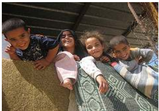
Arab Bedouin children.

In 4/10, the National Insurance Institute (NII) announced that a tender for leasing a new NII building in the Arab town of Shafa'amr had been completed and that the new building was being renovated for use at the end of 2011. The announcement came in response to numerous public demonstrations and an urgent letter sent by Adalah to the NII and Minister for Social Welfare complaining about the conditions of the existing NII building. Adalah argued that persons with disabilities could not access the current building to obtain the services they are entitled to by law.