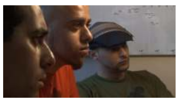
Palestinian rap group DAM during the making of Targeted Citizen

Targeted Citizen is a short film produced by Adalah on discrimination against Arab citizens in Israel, with a soundtrack by Palestinian rap group DAM. It was directed and written by Rachel Leah Jones. The film went "viral" in the second half of 2010, being viewed by tens of thousands of people on websites and Facebook , and it will be shown at several film festivals abroad. The film has proved an effective means of exposing Israel's treatment of the Arab minority to wide audiences.