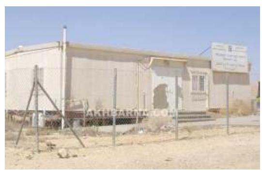
Mother and child clinic in the Naqab

The Health Ministry <u>re-opened mother</u> and child clinics in two Arab Bedouin villages in the Naqab: The ministry made the announcement in 8/10, stating that a clinic in Abu-Tlul village would be open three days a week, and a second clinic in Qasr al-Sir for two days a week. The