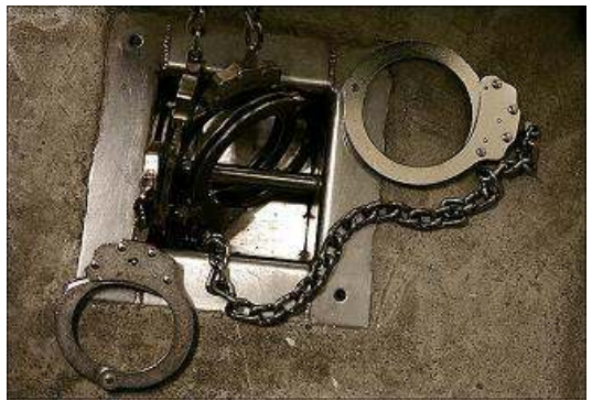
Shackling cuffs for interrogation

prisoners concerning their conditions of confinement to the district courts. However, in 10/10, following the appeal, the State Attorney's Office instructed the IPS not to block any petitions submitted by prisoners and to transfer them to court immediately.