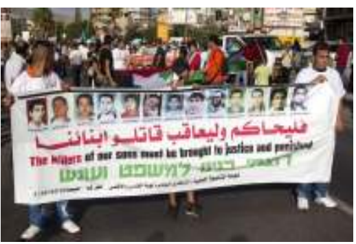
Demonstrators calling for justice and accountability for the October 2000 victims

October 2010 marked 10 years since the brutal killings of 13 unarmed Palestinian citizens of Israel and the injury of hundreds of others by the Israeli police security forces during protest and demonstrations throughout Israel. After a decade of legal, social and political struggle there has still been no implementation of the Or Commission of Inquiry's recommendations and none of the police officers, commanders or political leaders responsible for the killings and injuries have been held accountable.