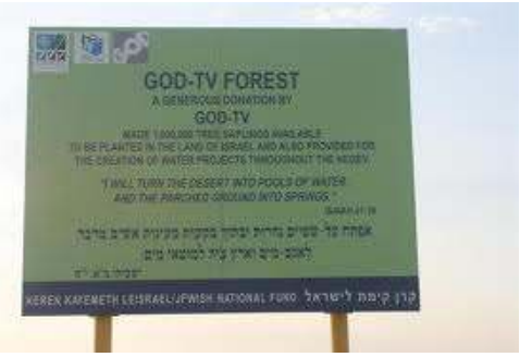
JNF forestation in the Naqab.

In 12/10, Adalah sent a letter to the ILA demanding the cancellation of an internal ILA decision ordering public land to be transferred to the <u>Jewish National Fund</u> (JNF) for forestation. The stated purpose of the decision is to "maintain control" of the land, and it was issued despite the fact that the land in question is not earmarked for the purpose in the national master plan for forestation. By transferring public land to the JNF, a body that admits it serves the interests of Jewish citizens only, the decision will prevent Arab use of the land, especially in the Naqab.