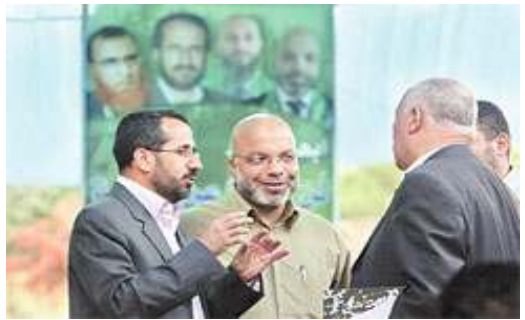
PLC members threatened with deportation. They are taking refuge at the Red Cross in Jerusalem.

attend an academic conference in Tunis three years ago.