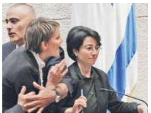
MK Zoabi being attacked in the Knesset

separate offenses in criminal а indictment filed against him, as a violation of criminal law and breach of his parliamentary immunity. MK Barakeh is accused of assaulting or insulting police officers during anti-Wall and anti-war demonstrations between 2005 and 2007. In 3/10, the Inter-Parliamentary Union affirmed that leading (IPU) and participating in demonstrations is an integral part of the parliamentary mandate.