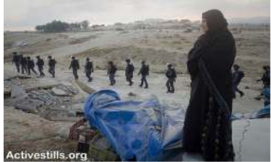
A Bedouin woman watching Israeli police entering Al-Araqib.

In 8/10, Adalah demanded criminal investigations into the police involved in the <u>demolition of the unrecognized Arab</u> <u>Bedouin village of Al-Araqib</u> in the Naqab , and into the presence of Tax Authority officials and the illegal debt collection operation. Police razed all 45 houses in the village to the ground and left all 250 villagers without a roof over their heads, with all their belongings confiscated. Adalah also published a position paper on behalf of 10 human rights and social