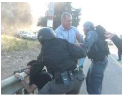
MK Barakeh during a demonstration

The political persecution of Arab MKs: In 2010, Adalah represented three Arab Members of Knesset (MKs) who have been charged with various criminal offenses and whose parliamentary immunity and privileges have been revoked or threatened.