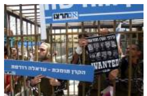
Radical right-wing group Im Tirtzu protests against the NIF and Adalah

European Parliament, Committee on Foreign Affairs, Sub-Committee on Human Rights. In 6/10, Adalah submitted a briefing paper to this committee entitled "Restrictions on human rights organizations and the legitimate activities of Arab political leaders in Israel," in advance of its hearing on "The Situation of NGOs and civil society in Israel." This paper was sent, together with presentations by PCATI and the EMHRN, to dozens of MEPs and was used extensively as a reference by them.