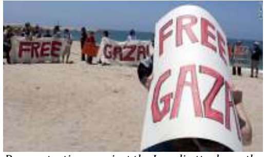
Demonstrations against the Israeli attacks on the Mavi Marmara

On 31 May 2010, in international waters, the Israeli navy intercepted and attacked the Mavi Marmara , one of six ships taking part in the Gaza Freedom Flotilla .